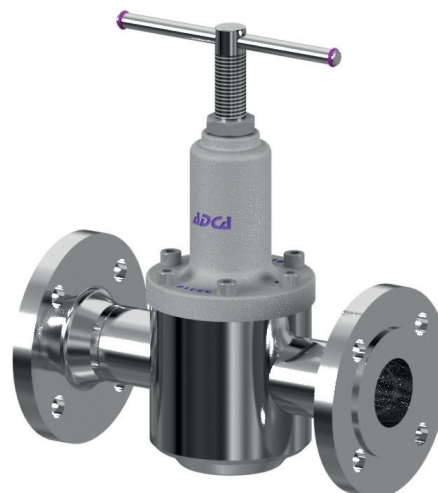
Type 11 B flanges

INSTALLATION: Horizontal installation. A "Y" strainer should be installed upstream of the valve. See IMI – Installation and maintenance instructions.