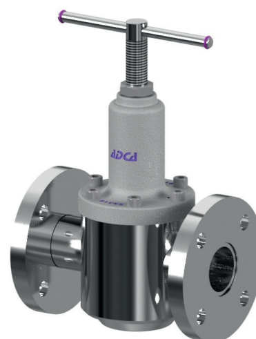
Type 01 A flanges